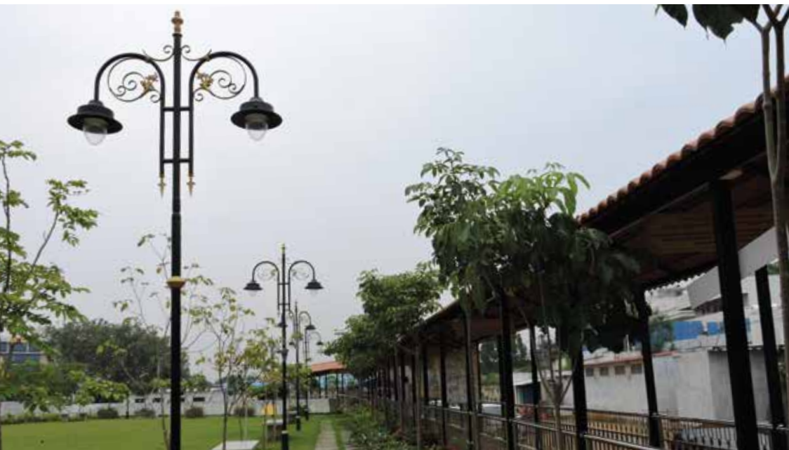
ISKCON TEMPLE, BENGALURU