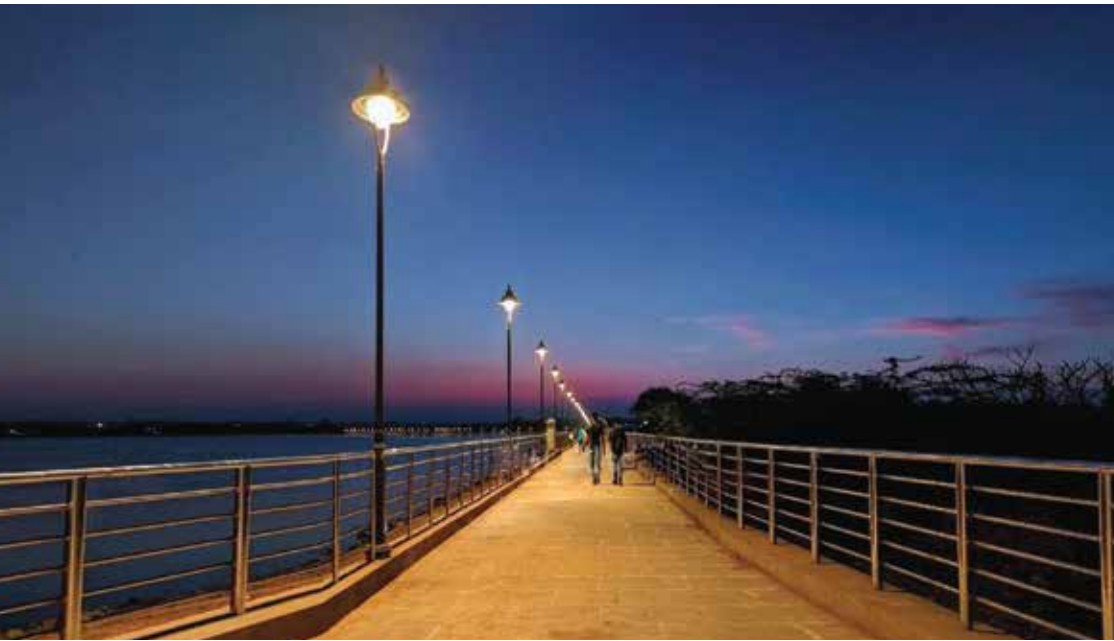
UNKAL LAKE, KARNATAKA