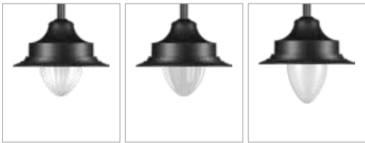
A8 - Translucent Acrylic A9 - Clear Acrylic A12 - Clear Polycarbonate

Pure polyester powder coated RAL 9004 Black RAL 9007 Grey aluminium RAL 7016 Anthracite grey Graphite grey