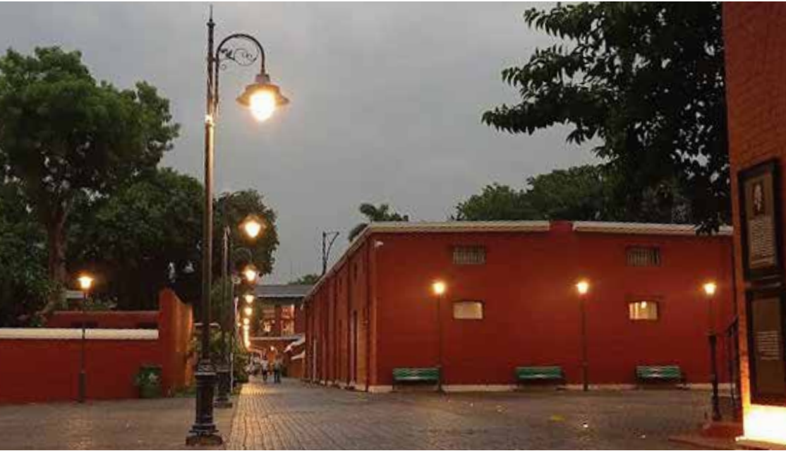
ALIPORE JAIL MUSEUM, KOLKATA