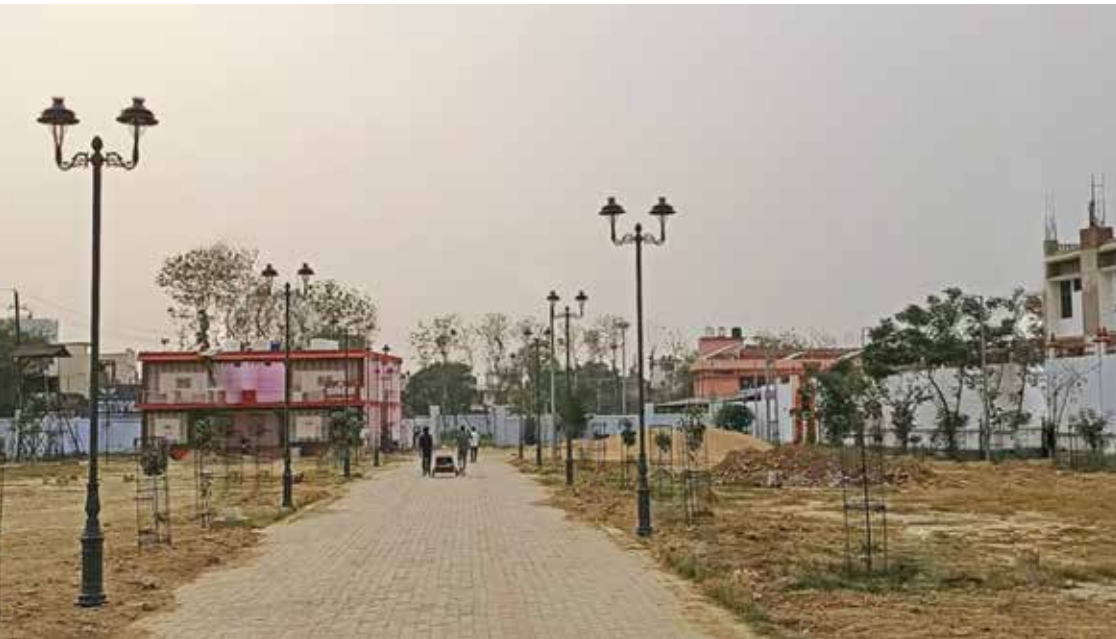
GORAKHNATH TEMPLE, GORAKHPUR