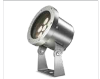
LED Fountain Light