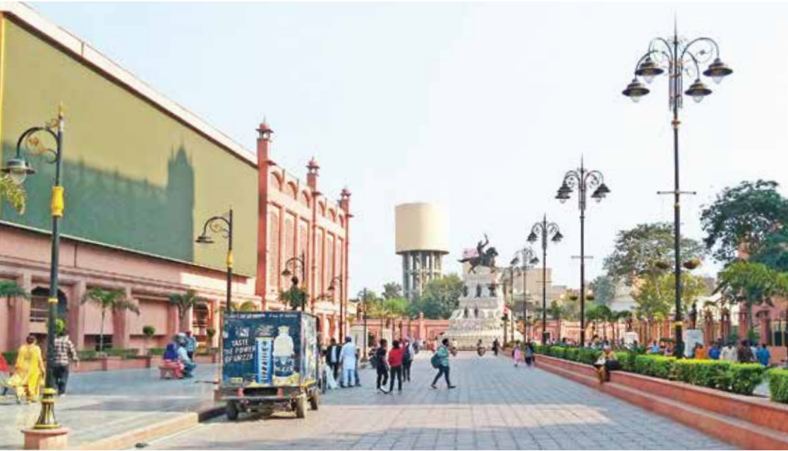
GMADA GOLDEN TEMPLE, AMRITSAR