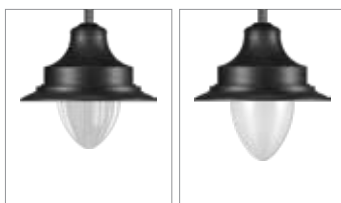
A9 - Clear Acrylic