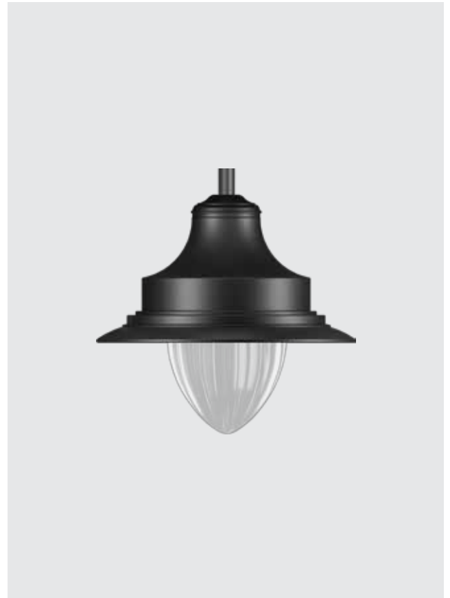
A12 - Clear Polycarbonate